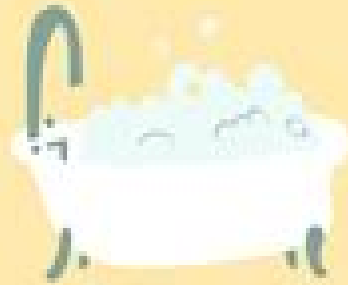
Take a bath