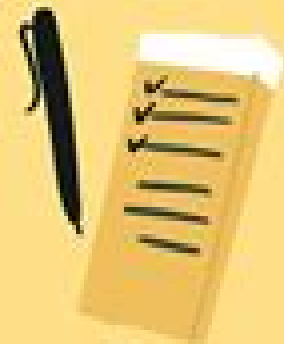
Create a to-do list