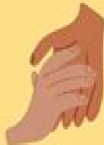
Ask for support