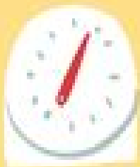
Work on managing time