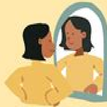
Give yourself a pep talk