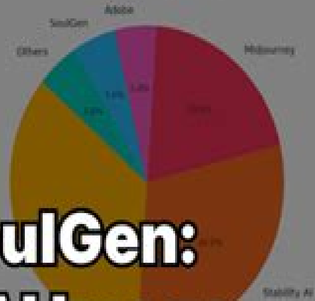
Market Share Distribution of Leading AI Image Generators in 2024