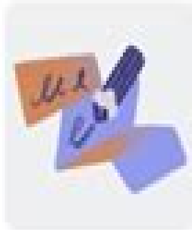
Subject line & preheader generator