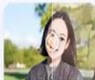
Image To Anime

https://imageupscaler.com/image-to-anime/