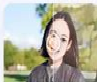
Image To Anime

https://imageupscaler.com/image-to-anime/