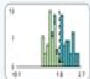
petal width (cm)