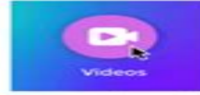
Canva Bkgrnd. Remover