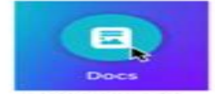
Canva Magic Write