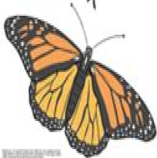
Illustration of a monarch butterfly.