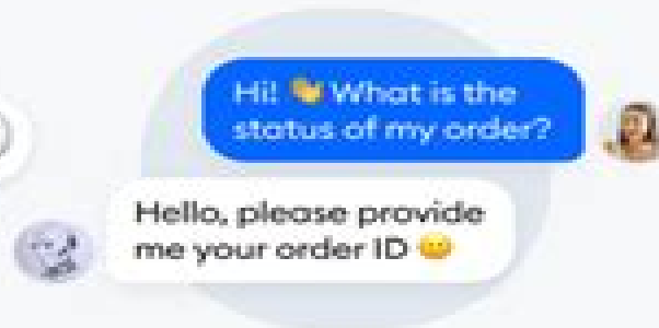
Natural language processing