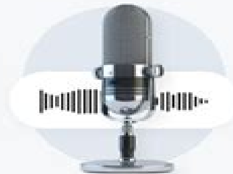
Voice recognition system