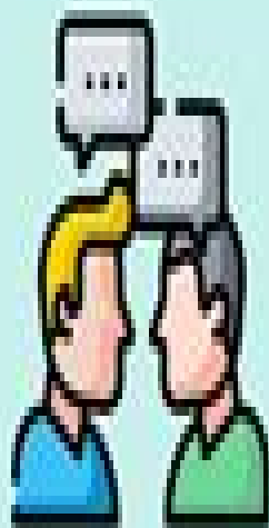
Face To Face Surveys