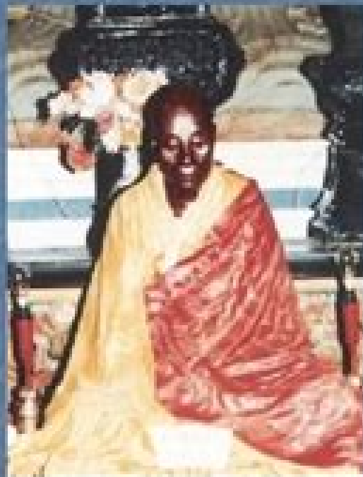
Hui-neng 惠能 (635-713)