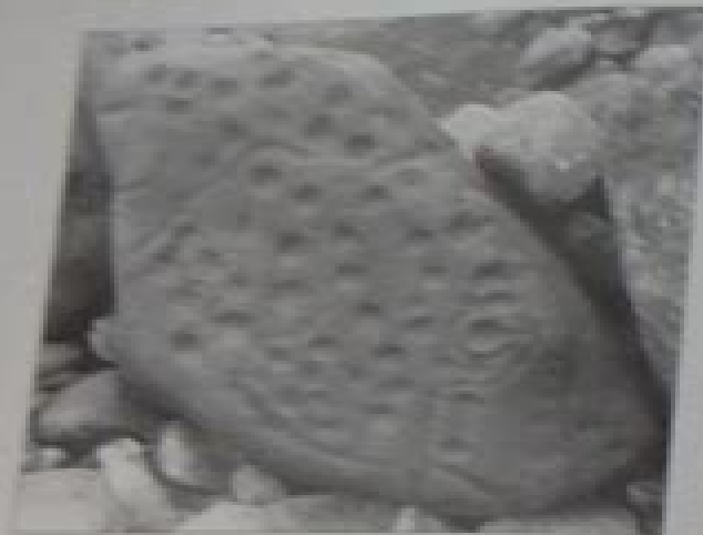
PLATE 17. Balnasson of Glen North-east (INV 85), cup-and-ring marked kerb-stone.

There are smaller hand-made pits, some number of cupmarks, some ringed (plate 17). There are further cupmarked stones in the same chamber: two archaic ones bear single cupmarks.