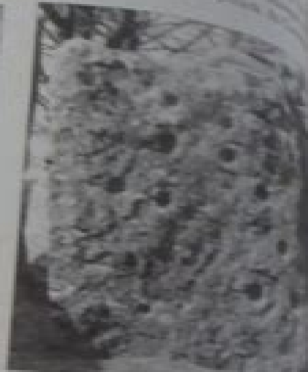
PLATE 18. Balnasson of Glen North-east (INV 86), cup-and-ring marked stone the chamber.

The cupmarks are the same as those seen singly or in a group, and are found in the chamber of the same stone. Some are seen the wall but a separate one.