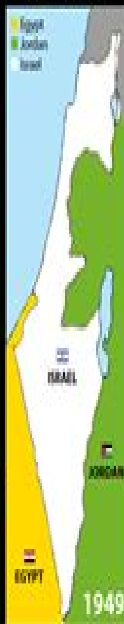
1948 Arab-Israeli War