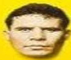
JULIO CESAR CHAVEZ