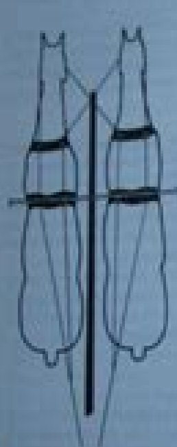
With single harness and single rein harness