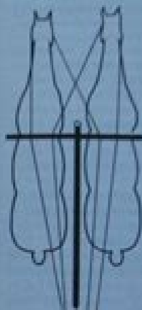
With single harness and single yoke