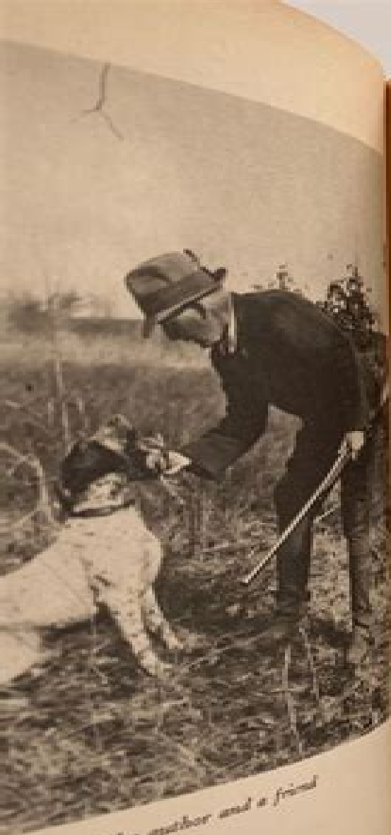
The author and a friend