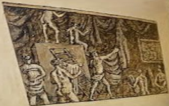
48 Gli armeni e i greci The Armenians and the Greeks 1911, 1912, 1913, 1914 Rome, Fondazione Giorgio e Isa de Chirico