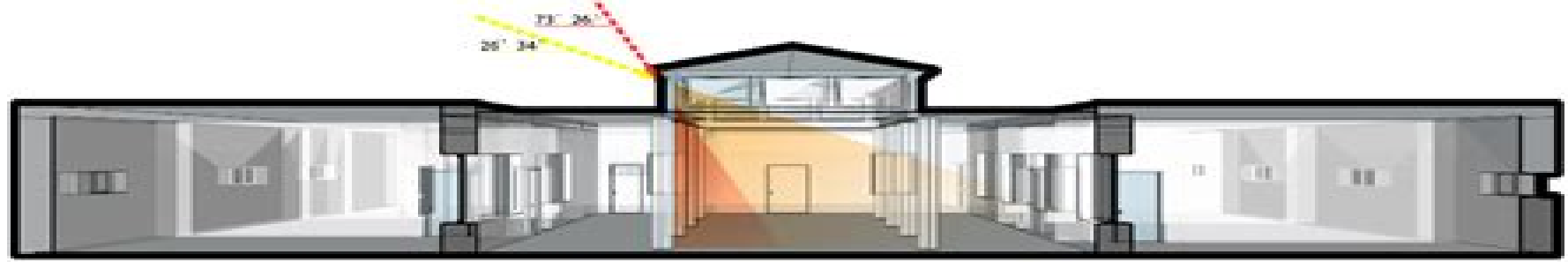
High side window form