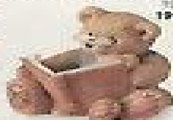
Teddy & Roosevelt 1993-930 1996-9175