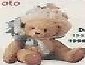
Daisy 1993-915 1996-9475