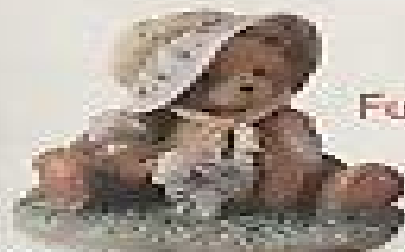
Charity 1993-930 1996-9300