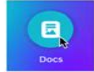
Canva Magic Write