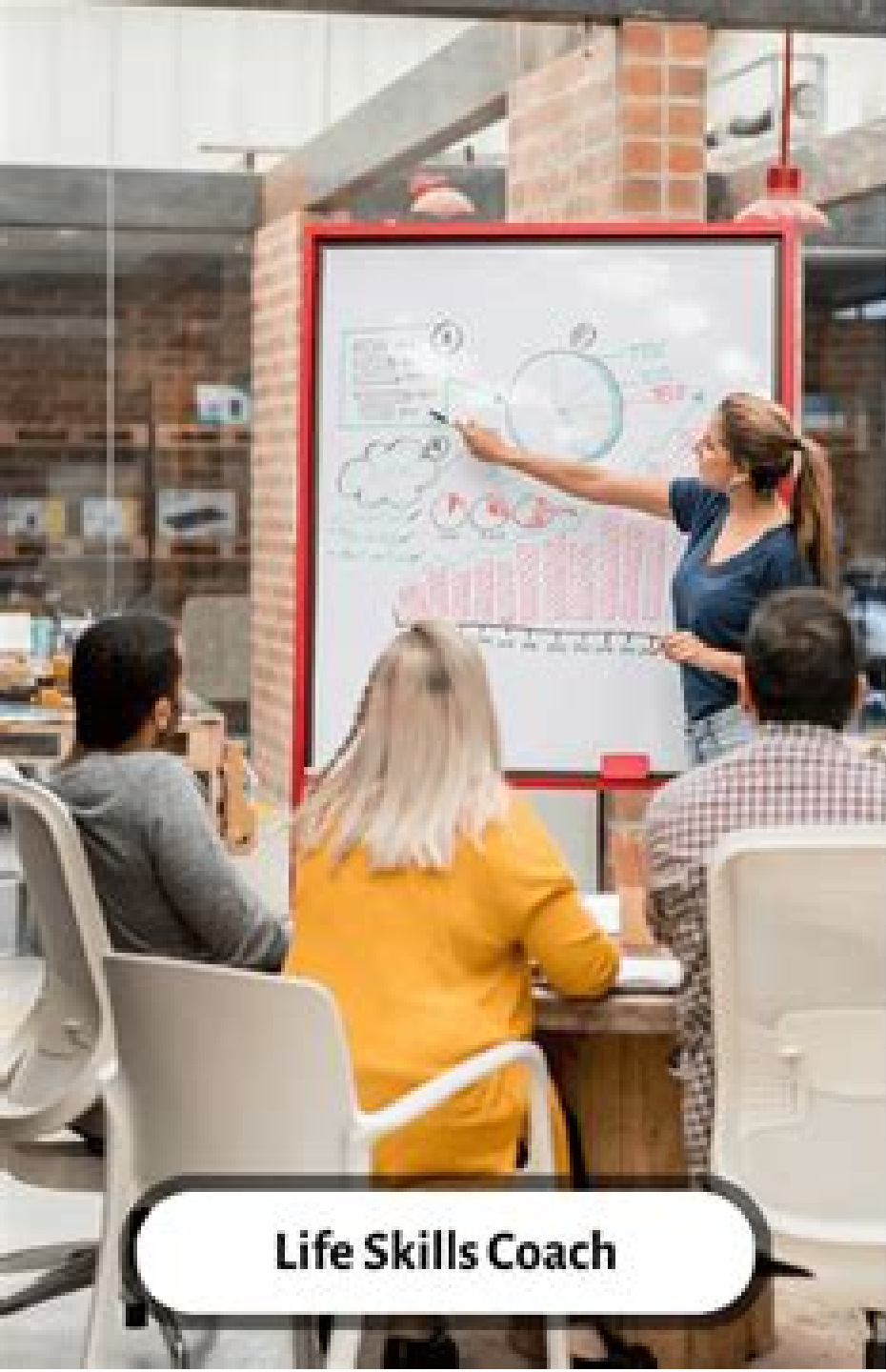
Life Skills Coach