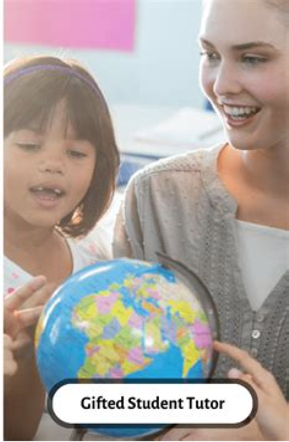
Gifted Student Tutor