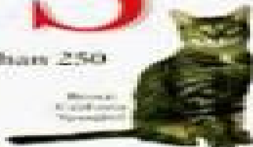
British Fold Scottish Fold