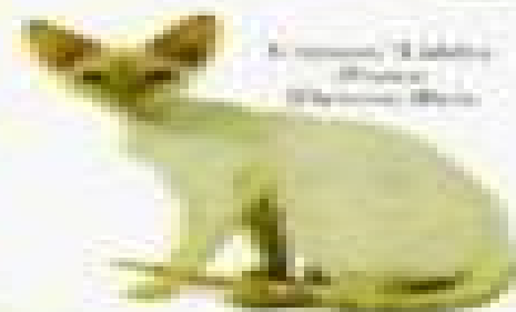
Siamese Point Burmese Persian