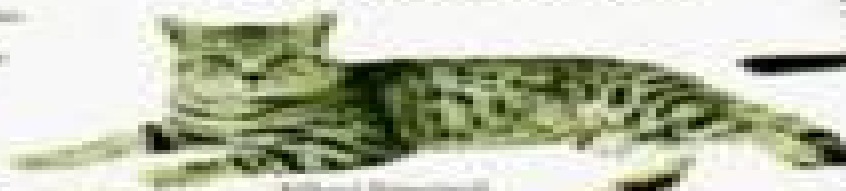
British Shorthair Manx