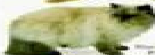
Siamese Point Burmese Persian