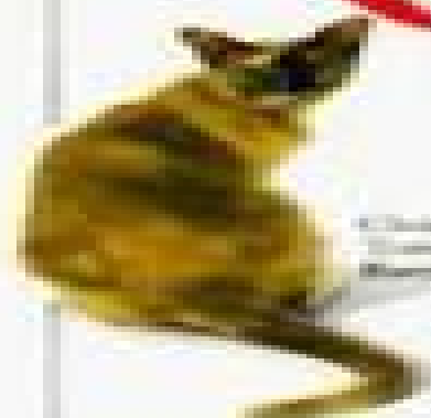
Chocolate Tortoiseshell Burmese

The visual guide to more than 250 types of cats from around the world