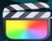
Final Cut Pro