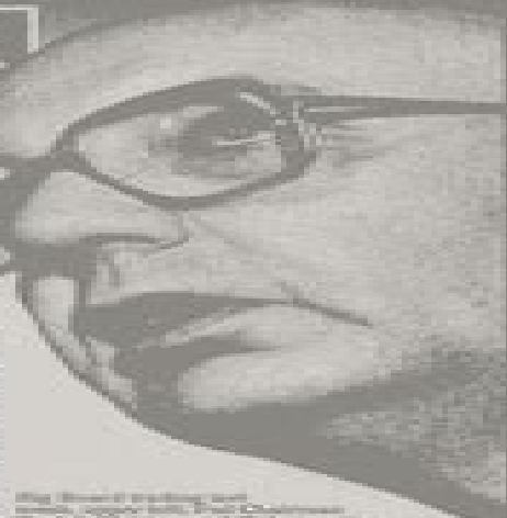
Mr. Volcker speaking last week with the Chairman, Paul A. Volcker, of the Fed.

The Great Crash of '79 was a turning point in the history of the American economy. It was a time when the economy was in a state of deep recession and the government was struggling to find a way out. The crash was caused by a combination of factors, including a sharp rise in interest rates and a loss of confidence in the government.