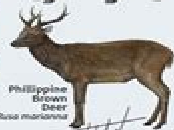
Philippine Brown Deer Rusa marina