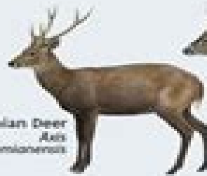
Calamian Deer Axis calamianensis