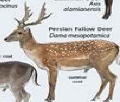
Persian Fallow Deer Dama mesopotamica