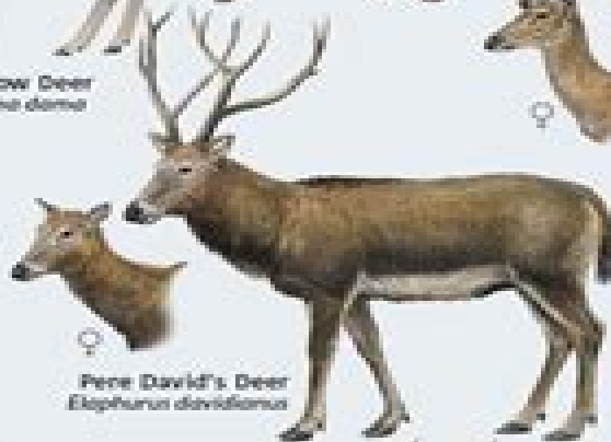
Pere David's Deer Elaphurus davidianus