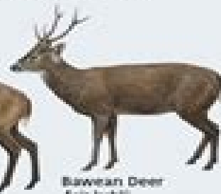
Bawean Deer Axis kuhlii