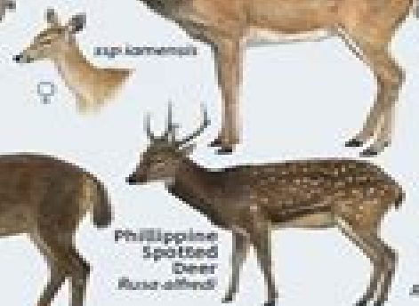
Philippine Spotted Deer Rusa alfredi