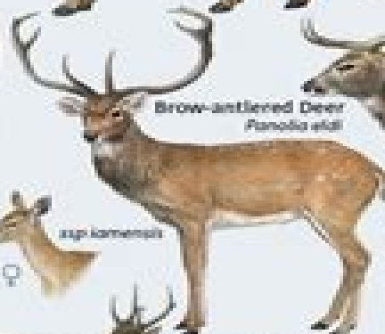
Brow-antlered Deer Panolia eldi