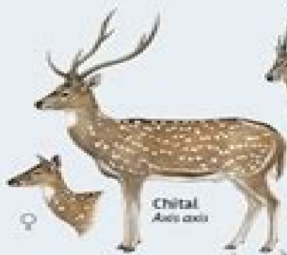
Chital Axis axis