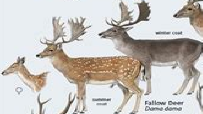
Fallow Deer Dama dama