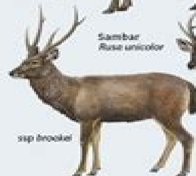
Sambar Rucervus eland