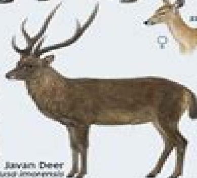
Javan Deer Rusa javanica