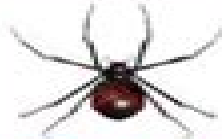
Southern Black Widow