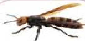
Asian Giant Hornet