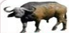
African Cape Buffalo