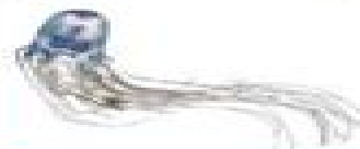
Australian Box Jellyfish