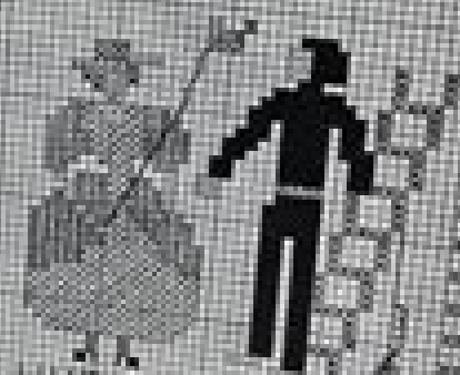
HYRINDEN OG SKORSTENSFEIEREN