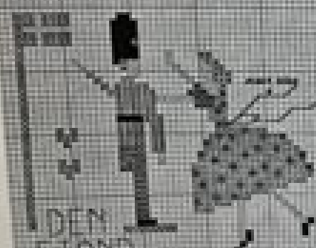
DEN STAND HÆFTIGE TINSOLDAT