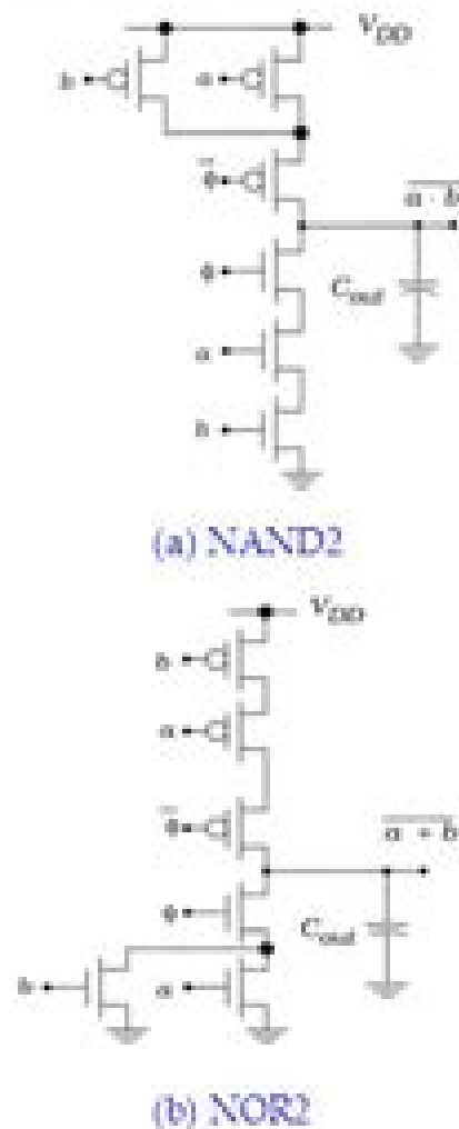
Figure 9.13 Example of C 2 MOS logic gate