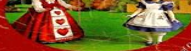
Alice in Wonderland ★ Alice and the Queen of Hearts