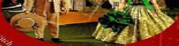
Gone with the Wind ★ Scarlett O'Hara and Rhett Butler