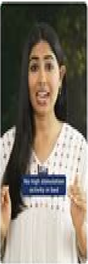
How to Wake Up at 5AM Everyday! Try This One Habit 4.5M views