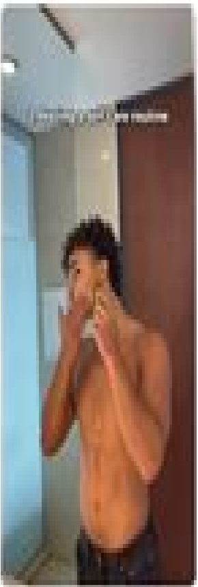
5 Habits to Improve Your Life 6.6M views