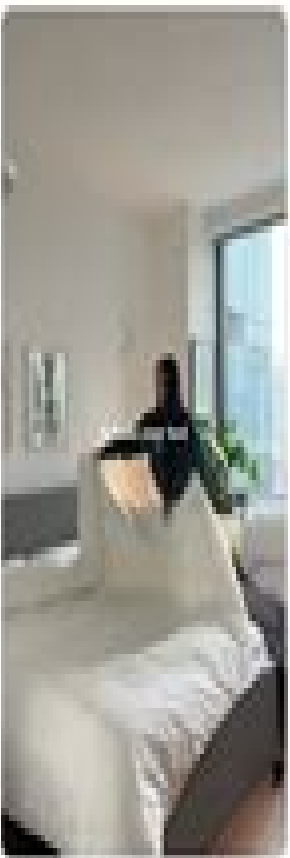
5 healthy habits you need for your morning routine 7M views