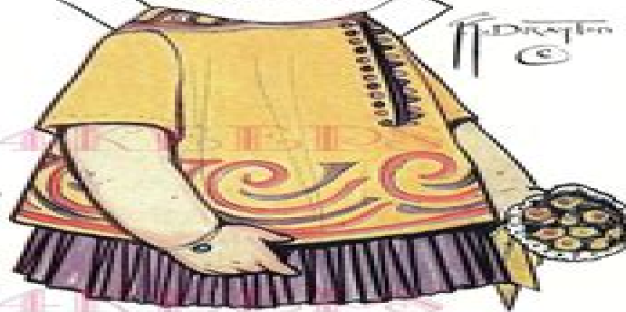
GWENNIE'S PARTY DRESS