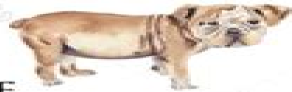
E English Bulldog