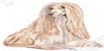
A Afghan Hound