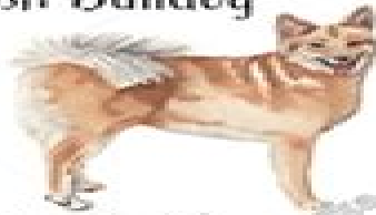
I Icelandic Sheepdog