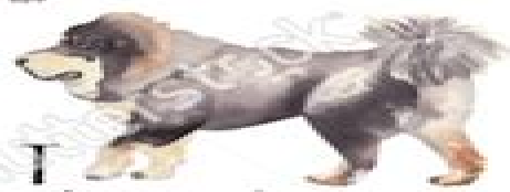
T Tibetan Mastiff