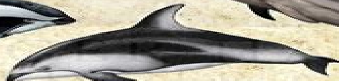
PACIFIC WHITE-SIDED DOLPHIN Lagenorhynchus heliophrys