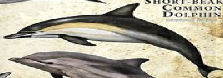
SHORT-BEAKED COMMON DOLPHIN Delphinus delphis