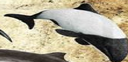
COMMERCIAL DOLPHIN Stenella commersoni