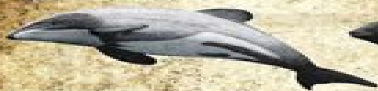
MAUI DOLPHIN Lagenorhynchus maui