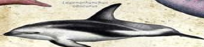
DUSKY DOLPHIN Lagenorhynchus obscurus