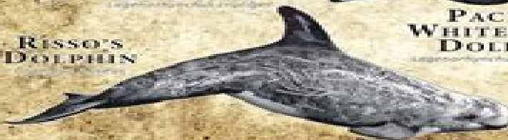
RISSE'S DOLPHIN Grampus griseus