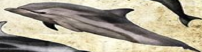
STRIPED DOLPHIN Megastoma lineatum