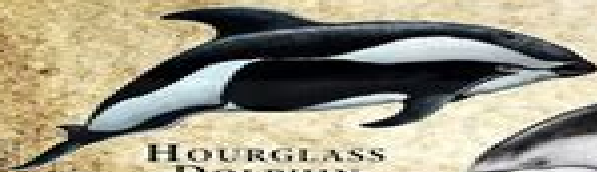
HOURLASS DOLPHIN Lagenorhynchus horridus