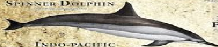
SPINNER DOLPHIN Stenella argentea