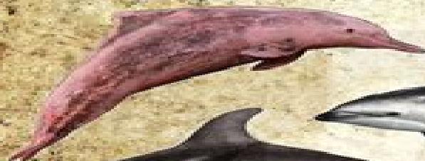
INDO-PACIFIC HUMPBACKED DOLPHIN Megaptera odon