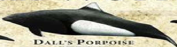
DALL'S PORPOISE Phocoenoides dalli