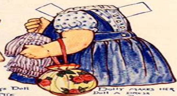
Dolly makes her Doll a dress