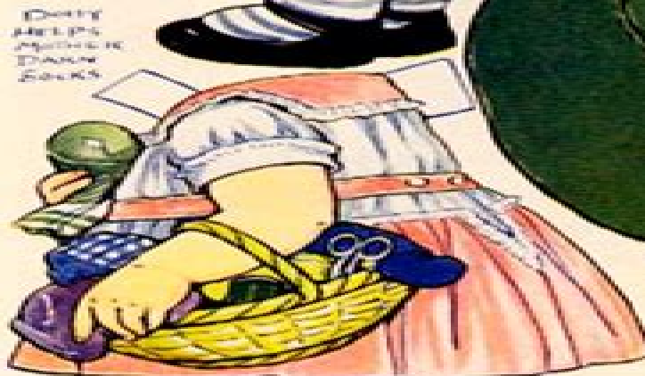
Dolly helps mother darn socks