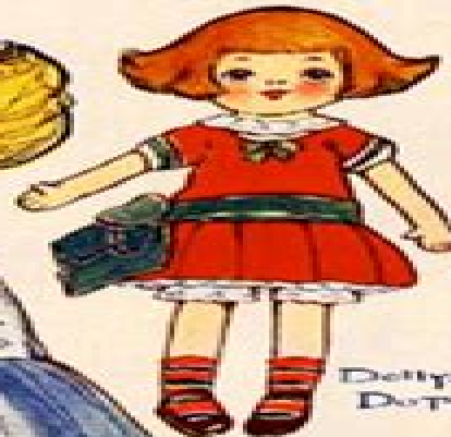
Dolly's Doll Dottie