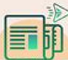
Document Delivery Service