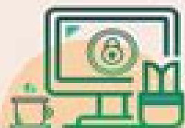
Remote Access to Electronic Resources via VPN