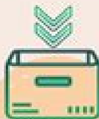
Drop box for Book Returns