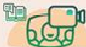
Online Instructions and Orientations