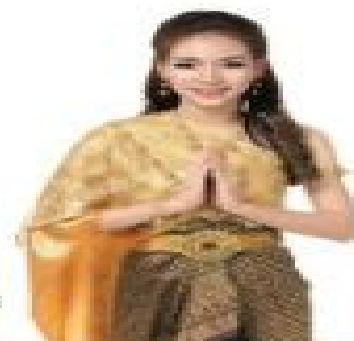
ไหว้ wái the traditional greeting of Thailand