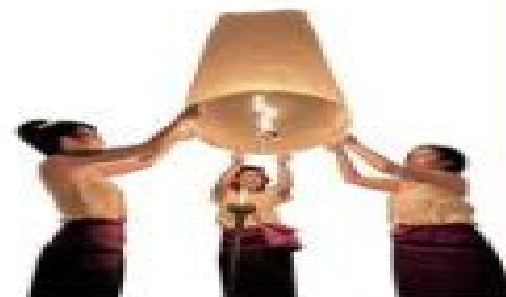
ประเพณีลอยโคม prá-phéi-lóy-khôn Lantern Festival