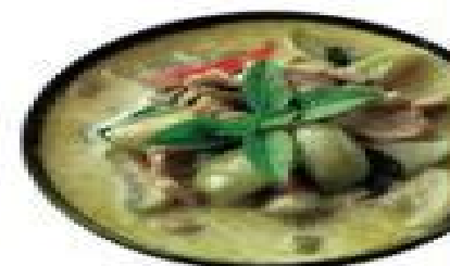
แกงเขียวหวาน gàng khíaw wân green curry