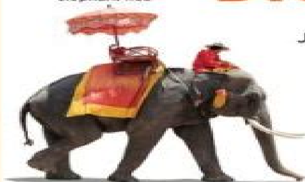
ช้าง nàng cháng elephant ride