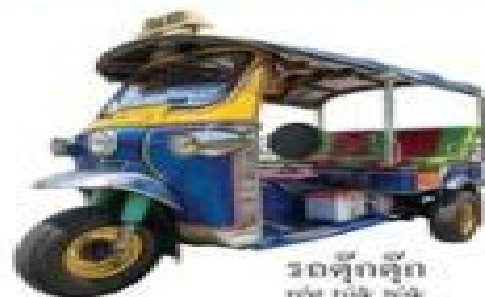
รถตุ๊กตุ๊ก rót túk túk motorized rickshaw