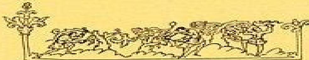
FEBRUARY. FURNING TREES.