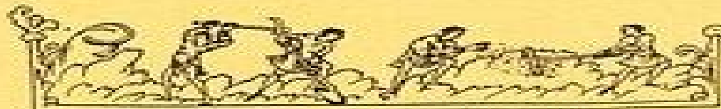
MARCH. BREAKING UP SOIL.—DRESSING—SOWING—HARROWING.