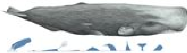
Sperm whale Physeter macrocephalus 11 - 18 m