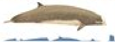
Southern bottlenose whale Hyperoodon planifrons 7 - 8 m