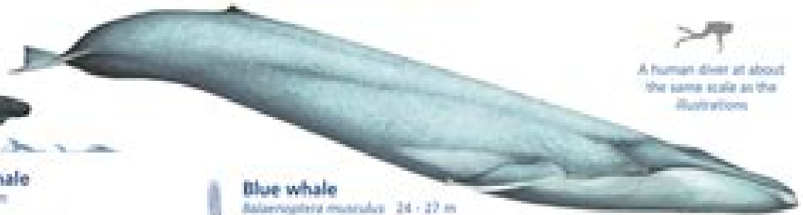
Blue whale Balaenoptera musculus 24 - 27 m