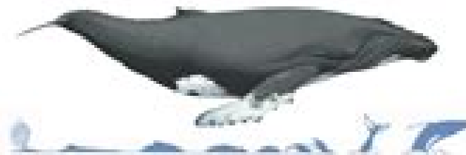
Humpback whale Megaptera novaeangliae 11.5 - 15 m