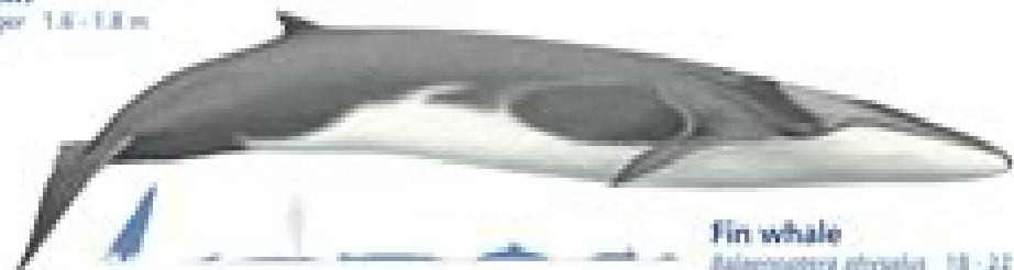
Fin whale Balaenoptera physalus 18 - 22 m