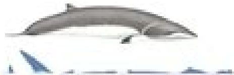
Antarctic minke whale Balaenoptera bonaerensis 7 - 10 m