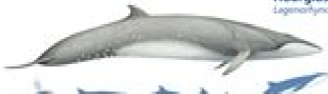
Sei whale Balaenoptera borealis 12 - 18 m