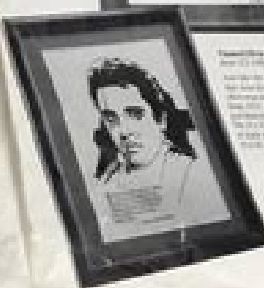
Elvis Presley Jan. 19, 1976

Elvis Presley, 35, is seen in a car, surrounded by fans, as he arrives at the airport in Memphis, Tenn., Jan. 19, 1976.