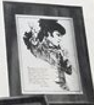
Elvis Presley Jan. 19, 1976

Elvis Presley, 35, is seen in a car, surrounded by fans, as he arrives at the airport in Memphis, Tenn., Jan. 19, 1976.