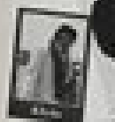
Elvis Presley Jan. 19, 1976

A black and white photo of Elvis Presley, 35, is seen in a car, surrounded by fans, as he arrives at the airport in Memphis, Tenn., Jan. 19, 1976.