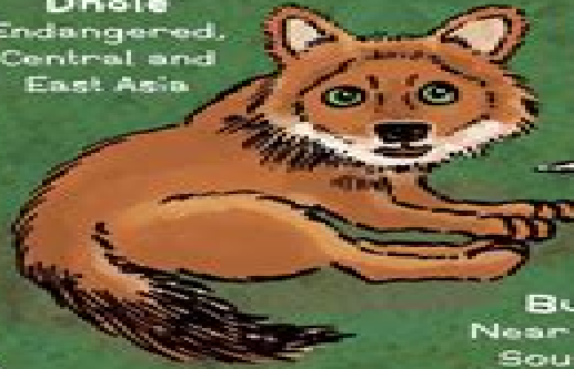
Dhole Endangered. Central and East Asia