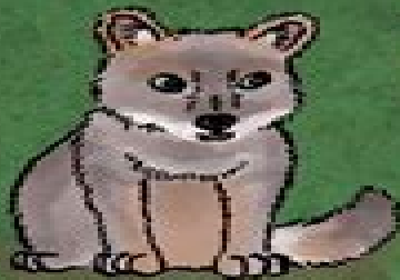
Darwin's Fox Endangered. South America