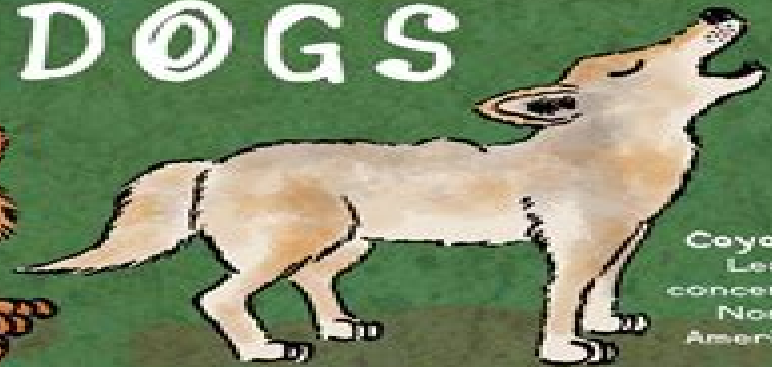
Coyote Least concern. North America