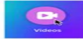
Canva Bkgrnd. Remover