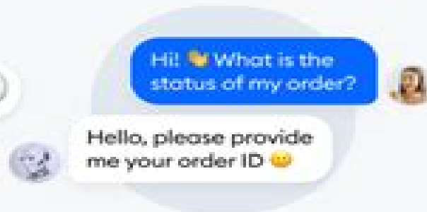
Natural language processing