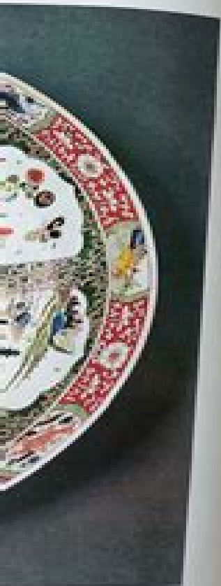
Abb. 10. Ein zirkuläres Porzellan-Plättchen mit einer Vogel- und Blumen-Inschrift.