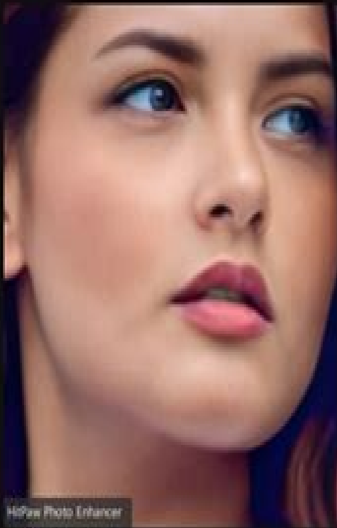
HiPaw Photo Enhancer