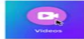
Canva Bkgnd. Remover