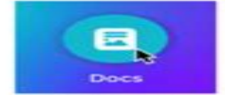
Canva Magic Write