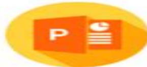
PowerPoint Spkr. Coach