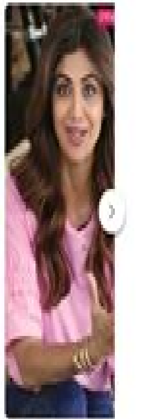
Ashiqua Shetty Shares Her Morning Routine For A... 1.3M views