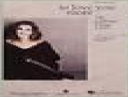
CHART HITS OF '98-'99