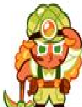
Orange Builder Cookie