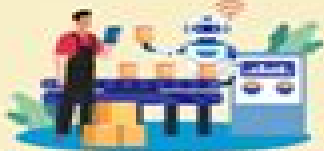
AI-Supported Logistics Tools