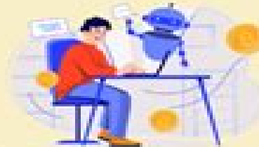
AI-Operated Virtual Education Platform