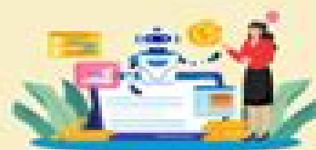
Artificial Intelligence in Retail