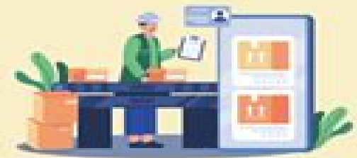
AI Home Management System