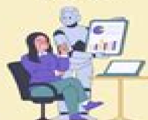
AI-Based Marketing Software