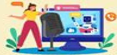
AI-Driven App for Cybersecurity