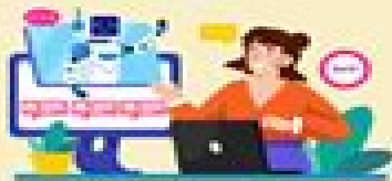
AI-Powered Entertainment Platform