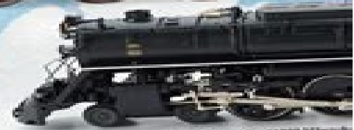
Lionel O gauge No. 11229 Milwaukee Northern steam engine & tender, O