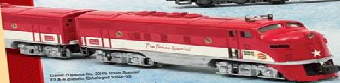
Lionel O gauge No. 2245 Texas Special F3 A-4 diesel, Cataloged 1954-55