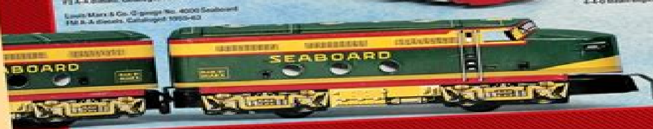
Lionel Marx & Co. O gauge No. 4000 Seaboard F5 A-4 diesel, Cataloged 1950-63