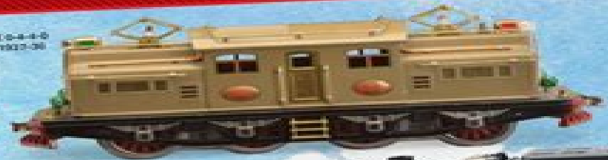
Lionel Standard gauge No. 4058 D-4-4-2 electric locomotive, Cataloged 1933-35