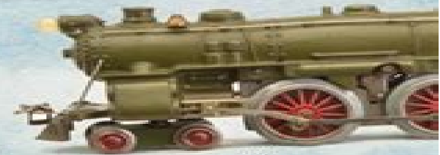
Bachmann Manufacturing HO gauge No. 1134 4-4-0 steam engine, Cataloged 1937